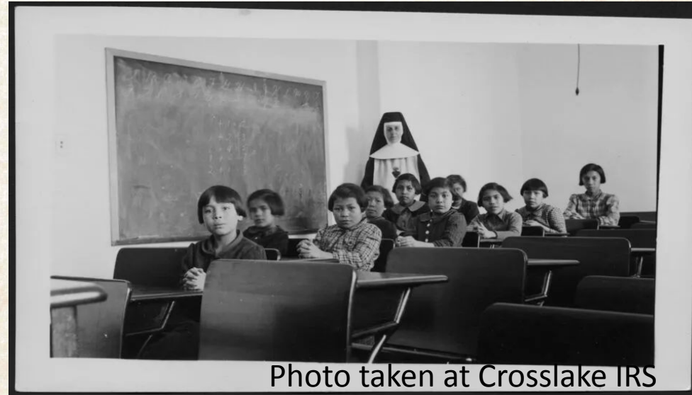
Photo taken at Crosslake IRS