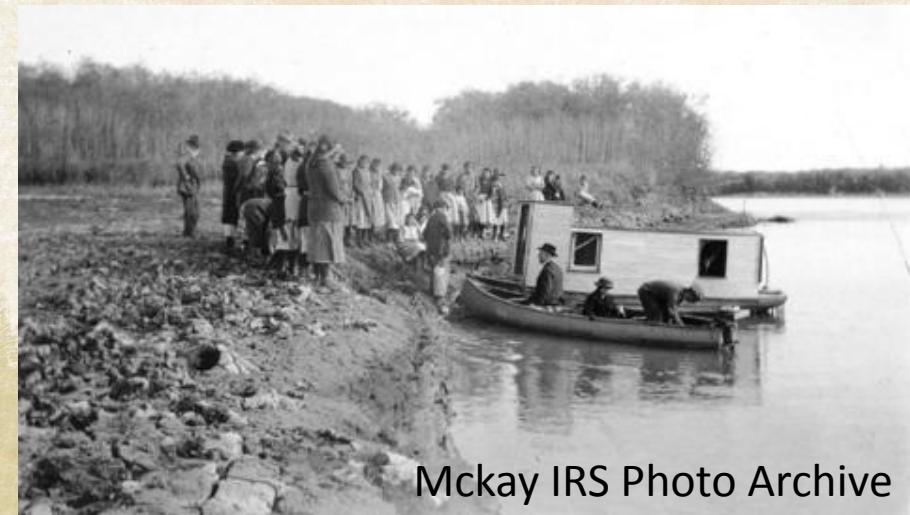
Mckay IRS Photo Archive